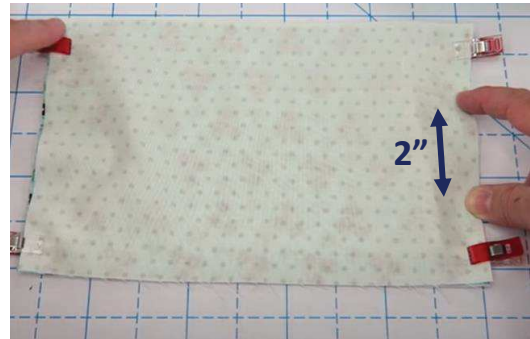
Figure D: Sew 1/4" seams on four sides, leaving a 2" hole on one side, double stitching over elastic.