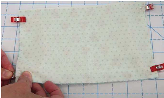
Figure C: Pin second (or lining) fabric right side down, keeping elastics in place