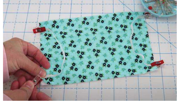
Figure B: Cut two 6" elastic pieces Pin them 1" from the edges